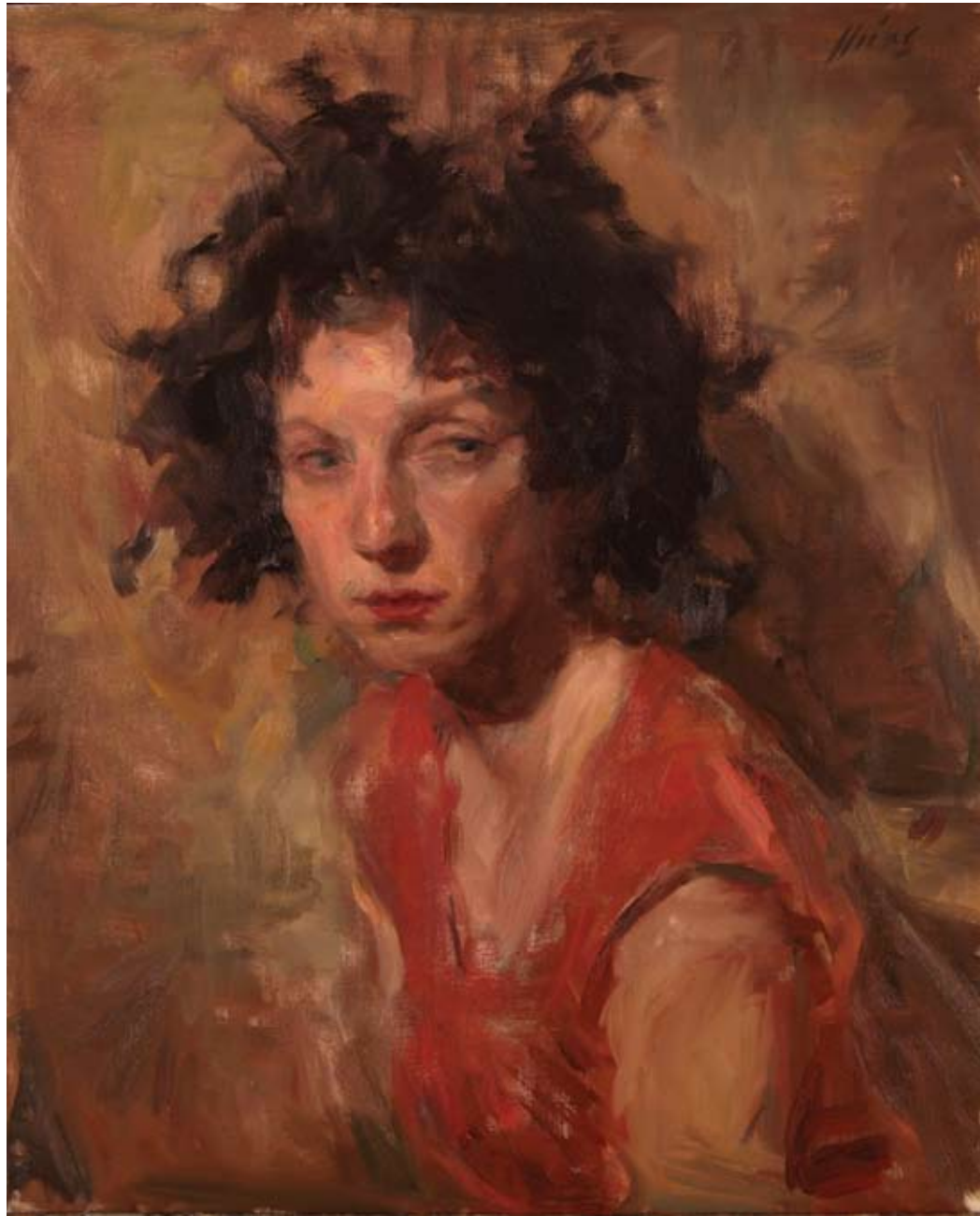
Ukrainian Woman with Feathers / 20" x 16" / Oil on canvas