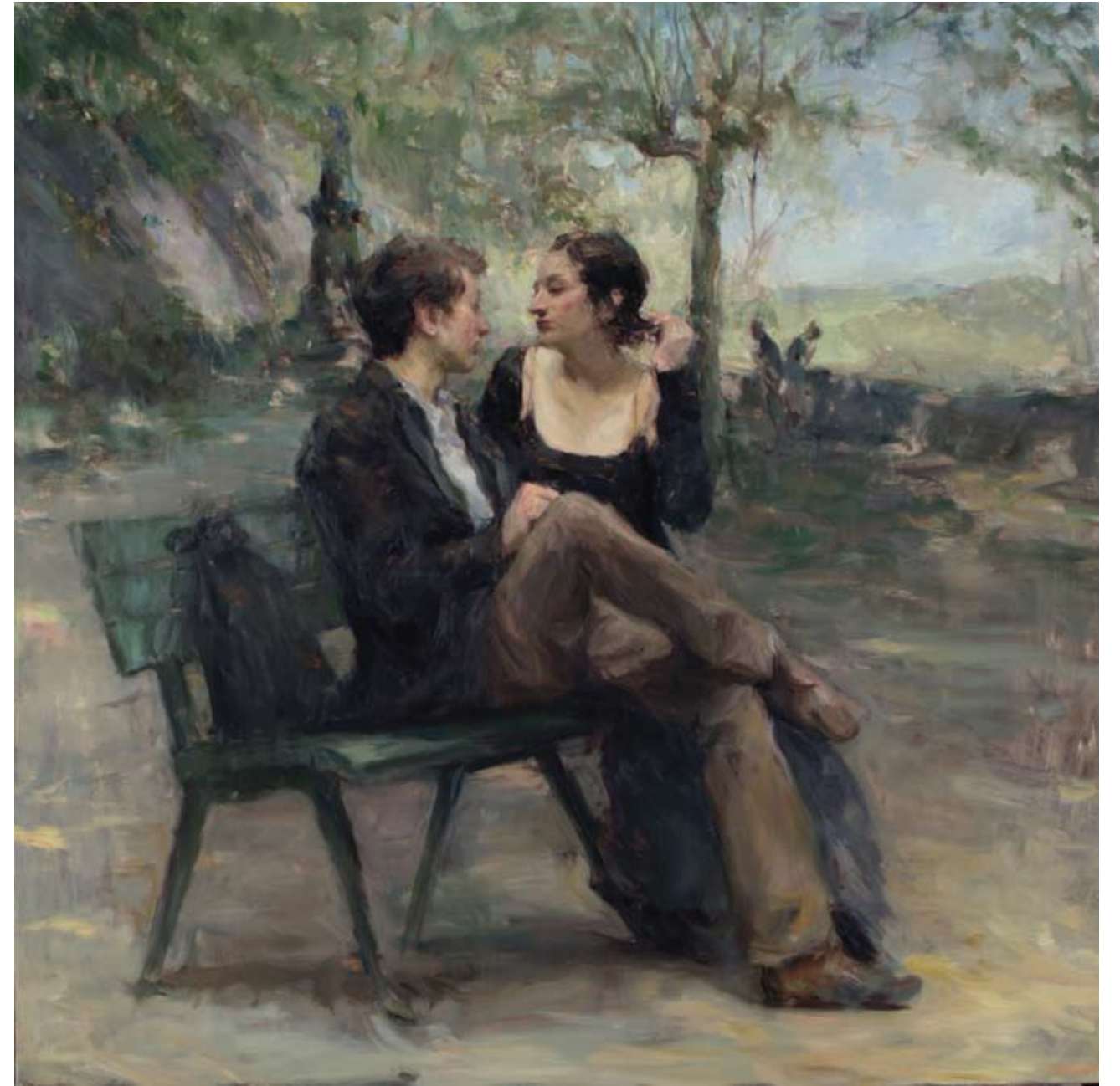
L'Après-Midi en Provence (An Afternoon in Provence) / 48" x 48" / Oil on canvas