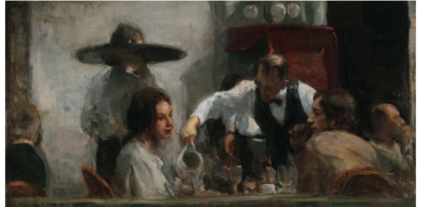
Casual Conversation / 20" x 40" / Oil on canvas