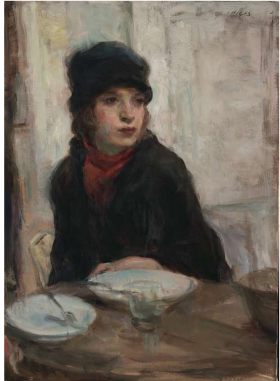
Afternoon at the Café / 24" x 18" / Oil on canvas