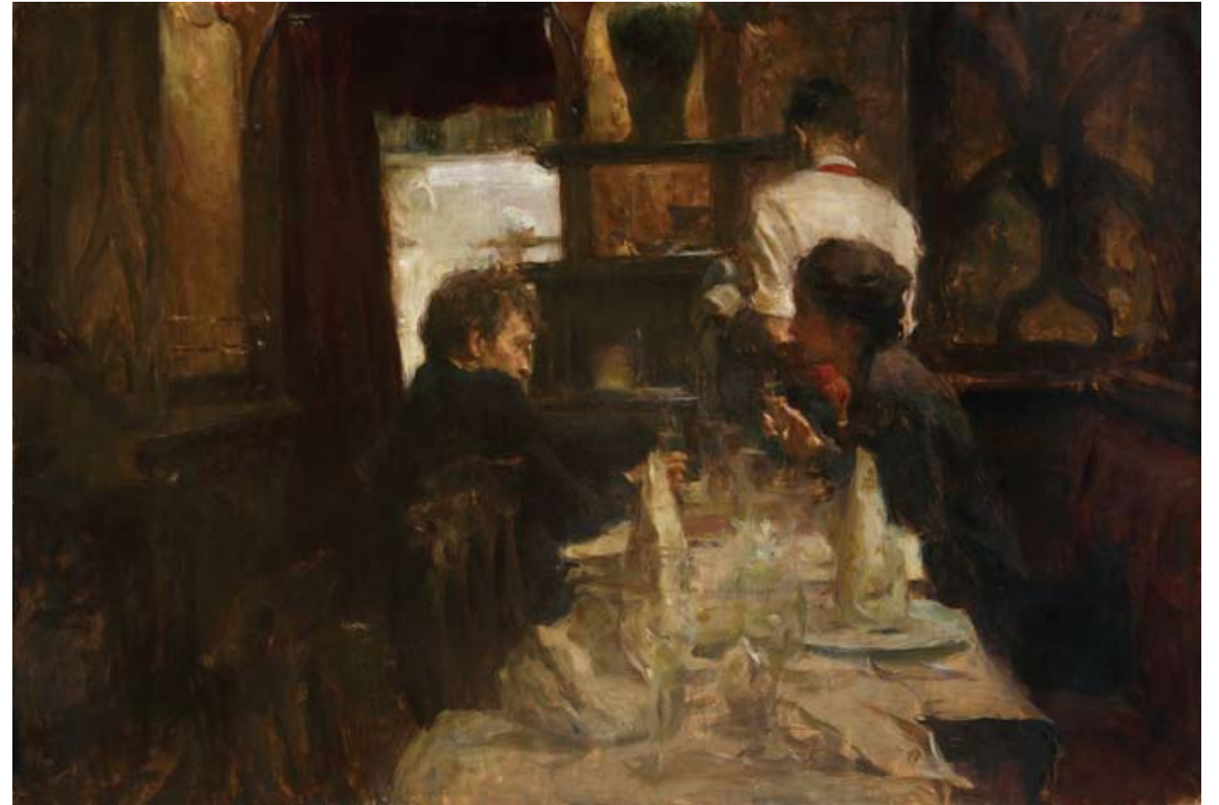
Here's to You / 40" x 60" / Oil on canvas