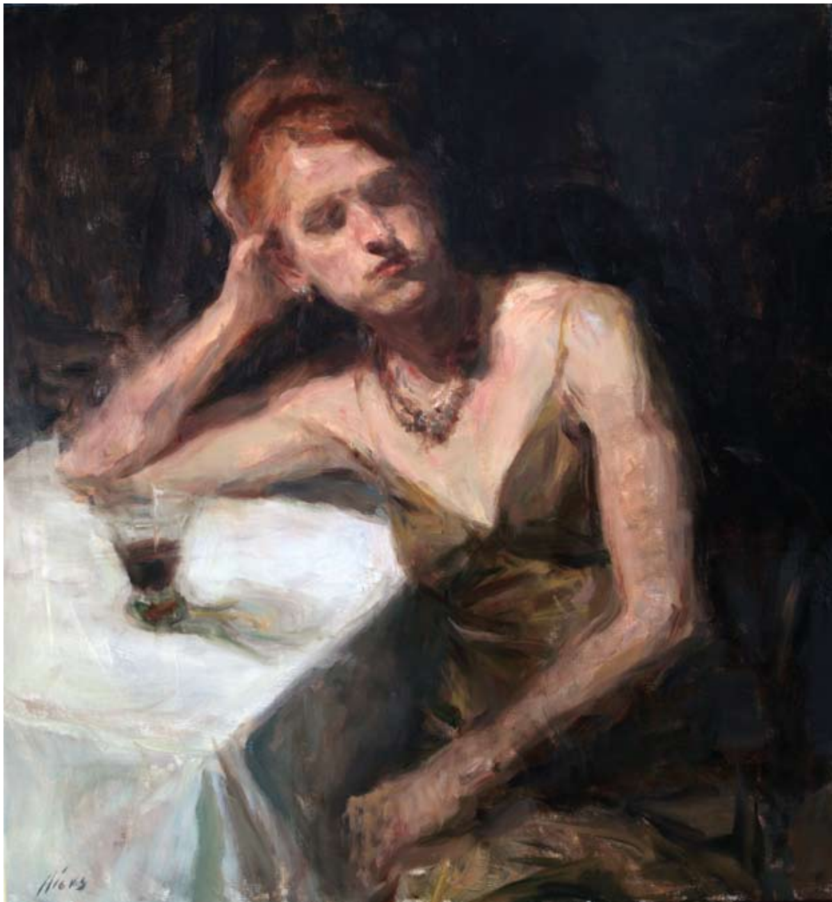
Too Much Time on My Hands / 24" x 30" / Oil on canvas