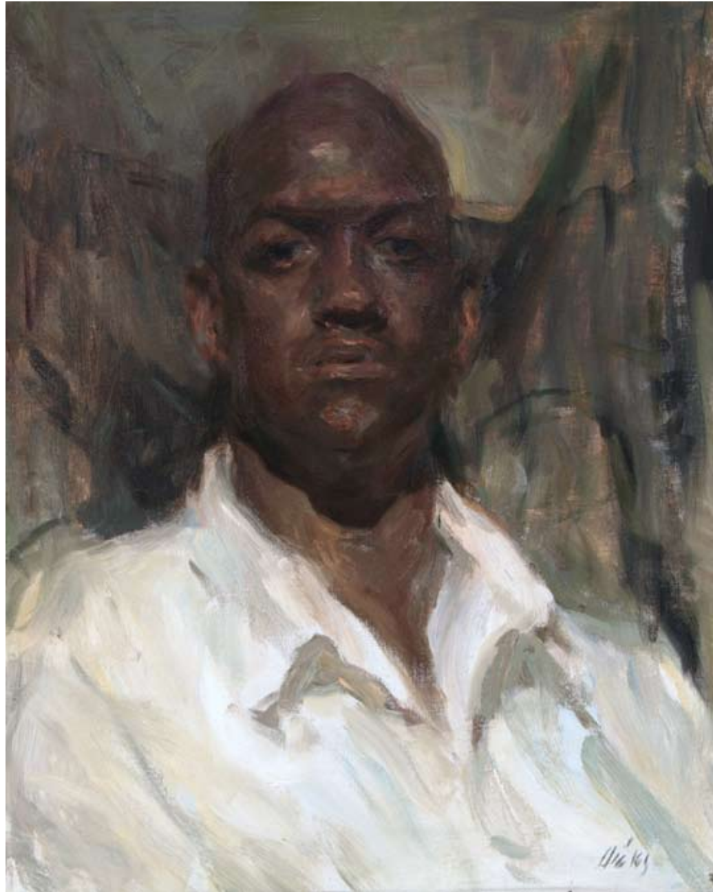
Lonnie the Great / 20" x 16" / Oil on canvas