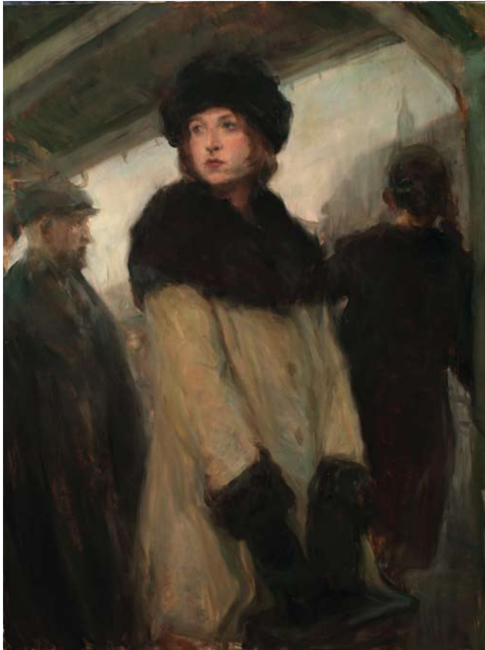
Going Home / 40" x 30" / Oil on canvas