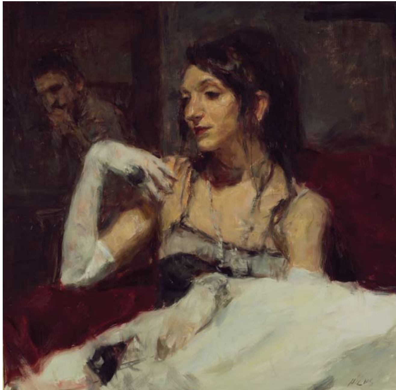
Ready to Go / 30" x 30" / Oil on canvas