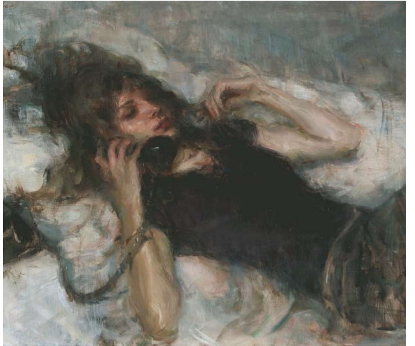
Night Caller / 24" x 30" / Oil on canvas